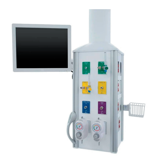
Figure 5: Gas outlets on a mobile boom attached to the ceiling.

In addition, the use of intraprocedural fluoroscopy has increased in both operating rooms and NORA sites. Radiation safety training for anesthesia professionals may be limited. The primary tenet of radiation safety is that exposure dose varies proportionally to the unprotected area of the person and inversely with the square of the distance.<sup>9</sup> The small size of many NORA procedure rooms prohibits the anesthesia professional from positioning themselves at sufficient distance from the X-ray tube. Small room size also makes it challenging to add a rolling shield between the anesthesia professional and the radiation source.