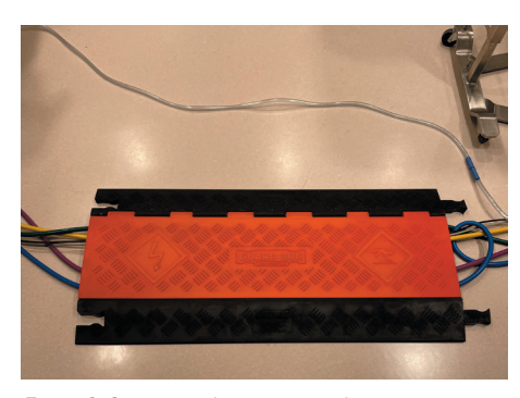
Figure 3: Commercial mat covering hoses.

ics as well as the presence of cords or other floor obstacles obstructing the wheels. The undue physical strain may be multiplied when different physical layouts increase the frequency of anesthesia machine movement.